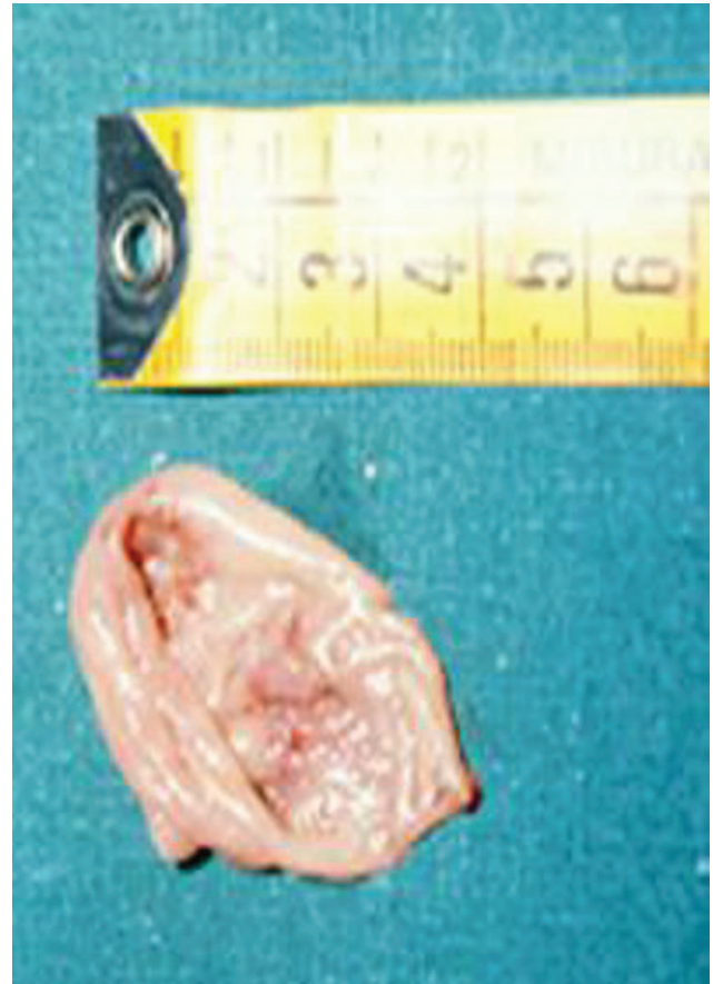
Figure 2 Postoperative diverticulum specimen.

ing to the left with barium passing into the cervical and thoracic esophagus without spilling of into the tracheo-bronchial tree (Figure 1). The patient admitted to having occasional episodes of dysphagia, regurgitation, and sialorrhea in the past 2 months. Further work-up of his diverticulum included an endoscopy that confirmed the diverticulum without irregularity of the mucosa in the esophageal inlet but with diffuse edema of the entire hypopharyngeal mucosa. He underwent left transcervical one-stage pharyngoesophageal diverticulectomy with removal of the sac using a stapling device (TA-30) and myotomy. Pathological examination revealed a 6 \times 5 \times 1.5 cm sac with normal external appearance (Figure 2). The sac contained an epithelial lining with stratified squamous epithelium. The submucosa showed fibrous tissue surrounding it with non-specific chronic mucosal inflammation noted in the wall of the diverticulum. Nearer the neck of the sac, scanty muscle fibers were found. An ulcerated tumor (grade 2, squamous cell carcinoma) measuring < 1 cm in diameter was identified at the fundus of the diverticular sac. The lesion had micro invasion of the submucosa and the muscularis mucosa (pT2) (Figure 3). Marked epithelia dysplasia was noted surrounding the lesion (Figure 4). Intense peri-tumoral lymphocyte reaction was present (Figure 3, 4). The mucosa at the site of excision was free of involvement (R0). Because of the