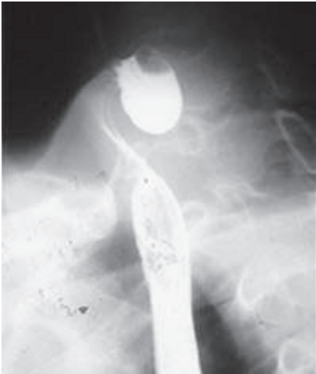
Figure 1 Radiological stage III diverticulum.

ing to the left with barium passing into the cervical and thoracic esophagus without spilling of into the tracheo-bronchial tree (Figure 1). The patient admitted to having occasional episodes of dysphagia, regurgitation, and sialorrhea in the past 2 months. Further work-up of his diverticulum included an endoscopy that confirmed the diverticulum without irregularity of the mucosa in the esophageal inlet but with diffuse edema of the entire hypopharyngeal mucosa. He underwent left transcervical one-stage pharyngoesophageal diverticulectomy with removal of the sac using a stapling device (TA-30) and myotomy. Pathological examination revealed a 6 \times 5 \times 1.5 cm sac with normal external appearance (Figure 2). The sac contained an epithelial lining with stratified squamous epithelium. The submucosa showed fibrous tissue surrounding it with non-specific chronic mucosal inflammation noted in the wall of the diverticulum. Nearer the neck of the sac, scanty muscle fibers were found. An ulcerated tumor (grade 2, squamous cell carcinoma) measuring < 1 cm in diameter was identified at the fundus of the diverticular sac. The lesion had micro invasion of the submucosa and the muscularis mucosa (pT2) (Figure 3). Marked epithelia dysplasia was noted surrounding the lesion (Figure 4). Intense peri-tumoral lymphocyte reaction was present (Figure 3, 4). The mucosa at the site of excision was free of involvement (R0). Because of the