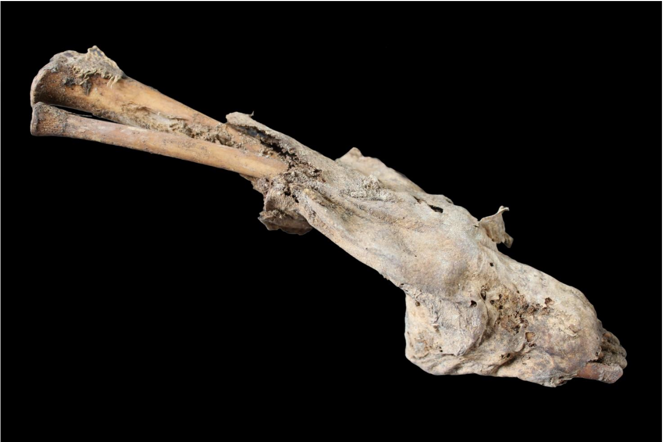
B Computed Tomography of lower limb showing the fracture of the fibula.