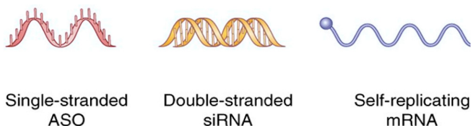
Figure 1. Main RNA used for cancer therapy.

RNA therapy acts on messenger RNA (mRNA) by using oligonucleotides that can interfere with different metabolic processes of a polynucleotide, such as splicing, the mature process starting from pre-mRNA, transport, translation, and degradation [1]. Differently from standard chemotherapy, RNA therapy harbors high specificity and may be used to target multiple critical oncogenic drivers, reduce drug resistance of tumor cells, and arrest growth of advanced-stage tumors [2]. RNA therapeutics may act through several mechanisms. They can inhibit the proliferation and induce apoptosis of tumor cells, prevent the metastasization process, disrupt the gene’s expression, inhibit angiogenesis, reconstruct the tumor environment, reprogram, and decrease drug resistance of tumor cells [2]. RNA therapy may be divided into three major classes: antisense oligonucleotides (ASO), RNA interference (RNAi) therapies, and messenger (mRNA) therapy (Figure 1 and Table 1). ASO are single-stranded sequences of 15–25 nucleotides that bind specifically to target mRNA by complementary base pairing. Because of ASO’s weak hydrophilicity, a common modification is thiolization to increase diffusion in tissues and absorption.