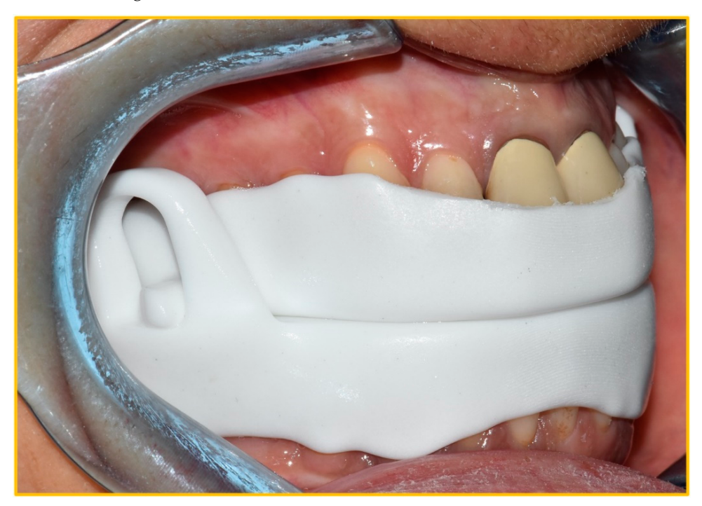
Figure 1. The device worn by the patient.

technology, which allows reducing its size. NOA® allows the patient a wide range of jaw movements (Figure 1).