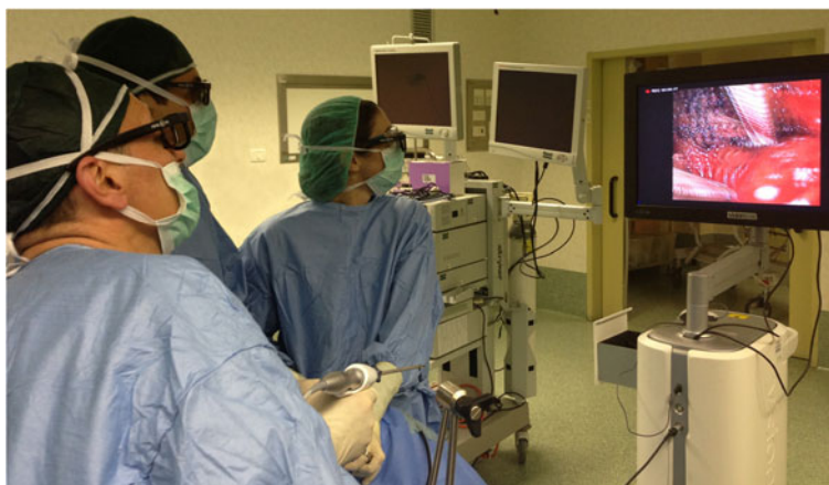
Figure 1 Minimally invasive video-assisted thyroidectomy. A view of the setting (endoscope, video camera and glasses) used for the 3D-MIVAT.

findings, technical aspects, operative time, rate of conversion into conventional technique and complications. The degree of difficulty of the 3D MIVAT technique was graded by the surgeon using a 5-point subjective scale, ranging from 5 (very easy) to 1 (very difficult) in order to recognize the upper and lower vascular pedicles, the parathyroids, the superior and inferior laryngeal nerves. Patients were asked to report their opinion according to the cosmetic results and postoperative pain. Cosmetic results were graded using a 4-point scale, ranging from 1 (very happy) to 4 (unhappy), while postoperative pain was evaluated by a visual analogue scale (VAS) from 1 (no pain ever) to 10 (worse pain).