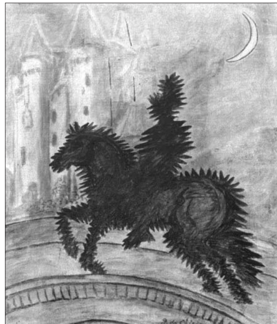
Figure 1 - Giorgio de Chirico: "Return to the Castle" (Ritorno al castello), 1970.

The pattern of migraine aura manifestations is highly personal, whereas the far more frequent visual phenomena are, in most cases, surprisingly similar, being characterised by constant, recurring shapes. However, some "creative migraineurs" such as Giorgio de Chirico, Friedrich Nietzsche, Gerolamo Cardano, Lewis Carroll, and Hildegard of Bingen can be credited with turning what for some is merely disability into an opportunity for the spreading of knowledge and awareness. For individuals such as these, migraine provides the initial stimulus for a complex elaboration (technical, stylistic, cultural or philosophical), this process of elaboration being the element that distinguishes art from everything that is not art (28). Hence, de Chirico's statues suspended in emptiness, his disconnected atmospheres, his forms which evolve into seemingly impossible constructions, and the strong sense of suspended time exuded by his paintings are all brilliant and highly personal variants of a language whose vocabulary manages to overcome the purely subjective dimension (29) (Fig. 1).