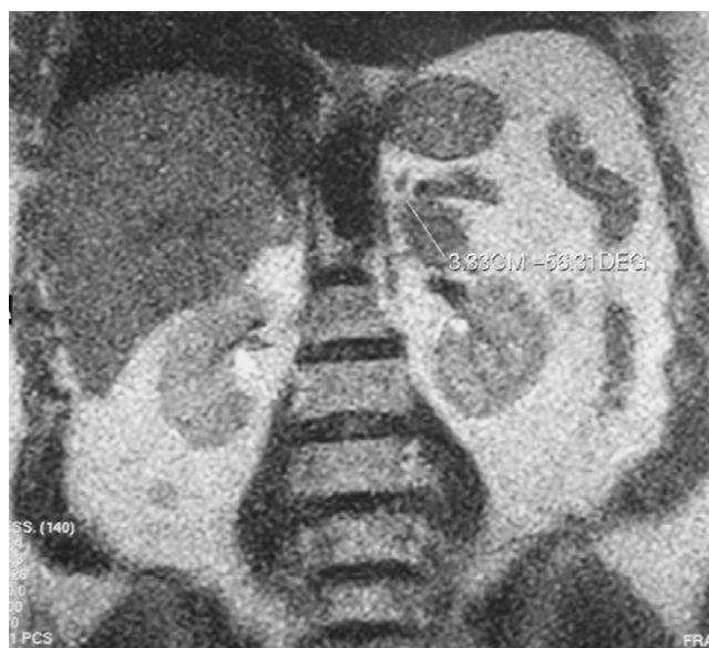
Figure 1 MRI T2-weighted imaging: central low-signal-intensity due to the extinguished cystic membrane and a more hypointensive rim of the cyst due to wall calcification.

This case is unusual due to the organ involved. Hydatid cysts can occur almost anywhere in the body [1,7]. The adult worm lives in the small intestine of the primary host. Ova are passed in feces and ingested by the intermediate host, which may include humans. Hatched embryos migrate through the intestinal mucosa, enter venules and lymphatics, and reach the liver. If embryos bypass the liver, they can reach the lungs via the inferior vena cava and heart. Embryos may reach other organs as the adrenal glands via the systemic circulation. A hydatid cyst of the adrenal gland is extremely rare: only 15 cases have been described to date in the English language medical litera-