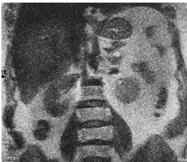
Figure 2 MRI T2-weighted imaging: little hyperintense nodular lesion in the upper pole of the cystic lesion related to a daughter cyst.

ture with an incidence of 0.5% [2-6]. Hydatid cysts in organs other than liver or lungs are usually part of generalized echinococcosis, and only rarely are they primary cysts as described in this case. Cysts of the adrenal gland are usually unilateral (90%) and show no special predilection for either side [2-6].