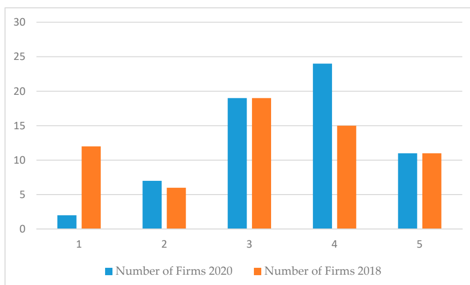
Figure 1. Click theory evaluation.

Considering this method, Figure 1 provides an interesting picture according to the scope of the paper.