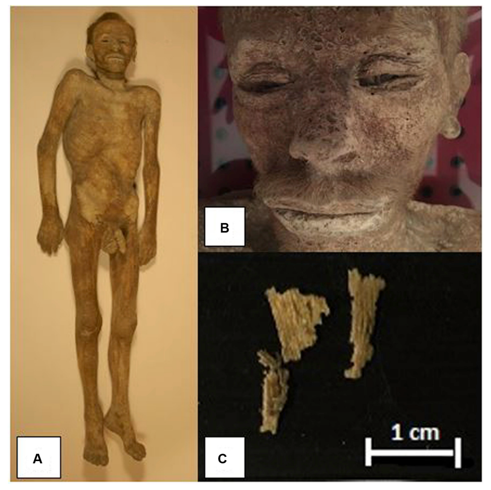
Fig 1. A , A petrified body in anatomic position. B , Close-up view of face affected by a vesicular and bullous manifestation. C , The fragments of skin biopsied from the lateroplantar region of the foot.

Our study was carried out on an already petrified body of an unknown individual affected by a widespread bullous skin manifestation (Fig 1, A and B) held in the Paolo Gorini Museum of Lodi (northern Italy). A superficial fragment of skin free of lesions was taken from the lateroplantar region of the right foot (Fig 1, C). The material was similar to a skin biopsy acquired by using the shave biopsy technique and, therefore, consisted mainly of a thin layer of hyperkeratotic epidermis with little underlying analysis performed on dermis. The was microscopic slides after the inclusion of samples in epoxy resin.<sup>4</sup> Resin embedding is an alternative technique used in the study of mummified tissues,