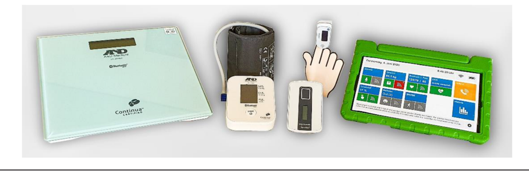
Figure 3 Example of a telemonitoring home equipment set to follow-up coronavirus disease 2019 patients: a tablet with a voice-analysing app using methods of artificial intelligence and an app for recording of a repeated 6 min walk test. Further devices are an electrocardiogram, a blood pressure device, a pulse oximeter, and a body scale.

Another e-cardiology approach represents telemonitoring with a daily transfer of vital parameter. This remote patient management model was established for recently hospitalized high-risk HF patients and is very beneficial under current pandemic conditions to these patients who are also at high risk for COVID-19. One example is the TELEMED5000-COVID-19 study (German clinical trial register number: DRKS00022244), which is an ongoing observational trial including 100 patients, which survived an inpatient stay of COVID-19. In addition to the home equipment used in telemedicine for HF patients, all study patients will receive a tablet with a voice-analysing app. The voice recording will be analysed using methods of artificial intelligence and is assumed to be a new vital parameter to quantify fatigue and/or pulmonary congestion. Another app should support repeated 6 min walking test in the patient's surroundings (Figure 3). This vital parameter could be used as a surrogate for changing exercise capacity during the recovery period. The follow-up period of this trial will be 1 year, and the first results will be available in 2021.