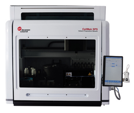
CellMek SPS Sample Preparation System

The CellMek SPS system helps you unlock the power of lean by addressing major process wastes related to sample preparation in your clinical flow cytometry laboratory. Drives Efficiency via Automation. Standardizes Processes & Reduces Potential for Error. Ensures Flexibility Via User-Defined Protocols. Provides Confidence in Results facilitated by a full audit trail. Frees up lab staff to deal with more value-added tasks.